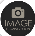
Lyn Coutts Programme Tutor Diploma of Teaching (ECE)